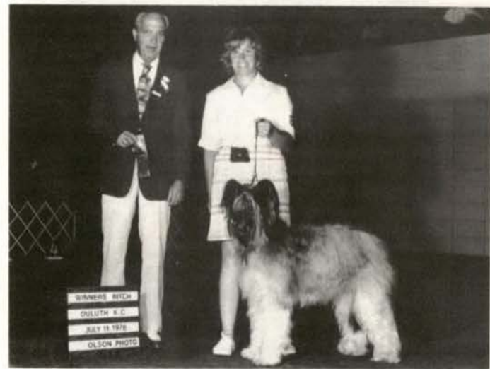
CHAMPION LAURDEEN'S L'AIMEE MON CHIENNE (bitch)