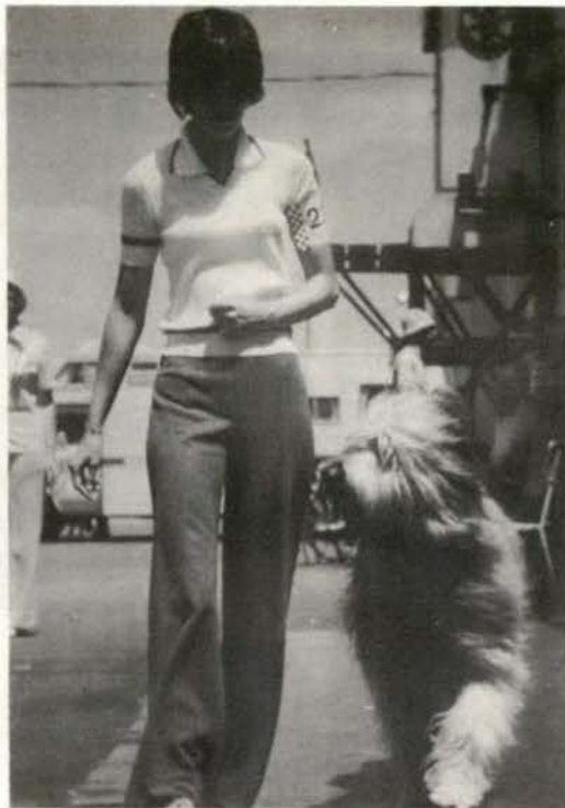
AM. & CAN. CH. PA'CHICK'S IMPRESARIO, AM. & CAN. C.D. (dog)