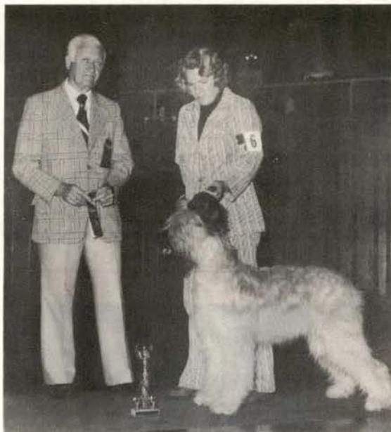
CHAMPION PA'CHICK'S LUVIN' LEGEND (bitch)