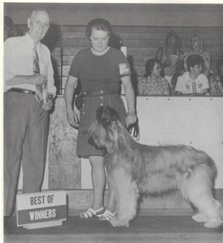
CHAMPION PA'CHICK'S UNCHAINED MELODY (bitch)