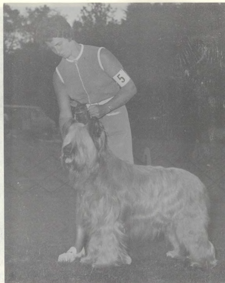
CHAMPION JANUS DE LA VILLE JUMEAU (dog)