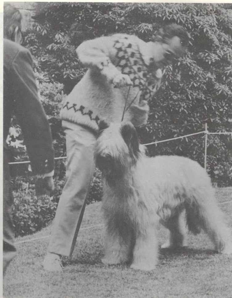
CHAMPION CHATEAUBRIARD VULCAN (dog)