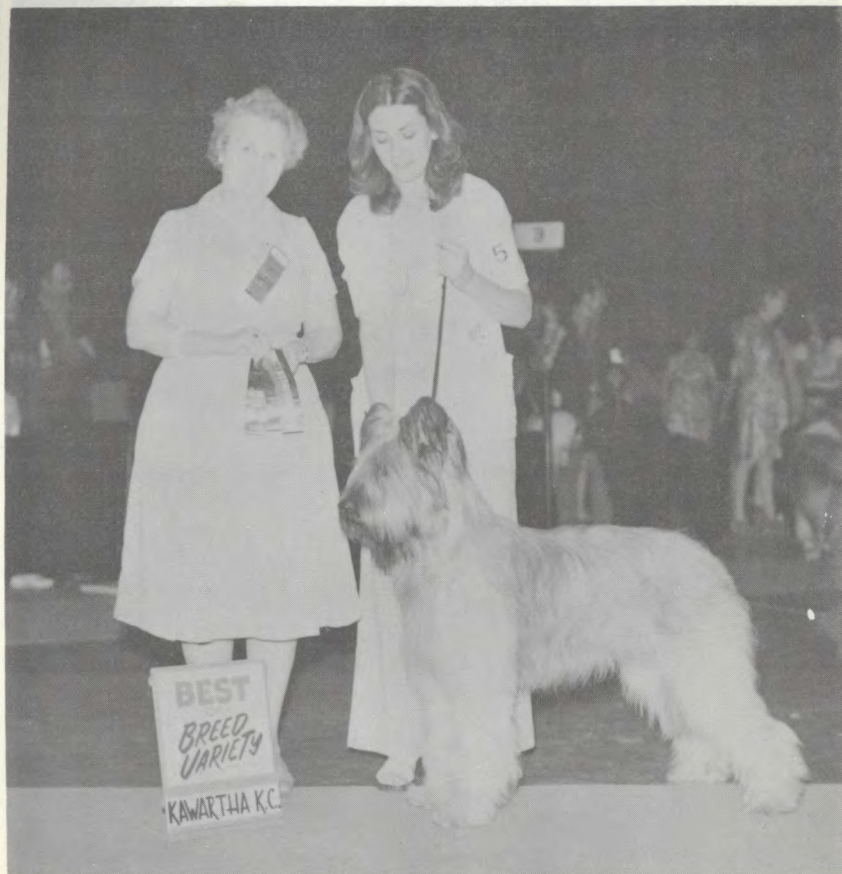
CHAMPION UTHIER BIJOU DE STRATHCONA (bitch)