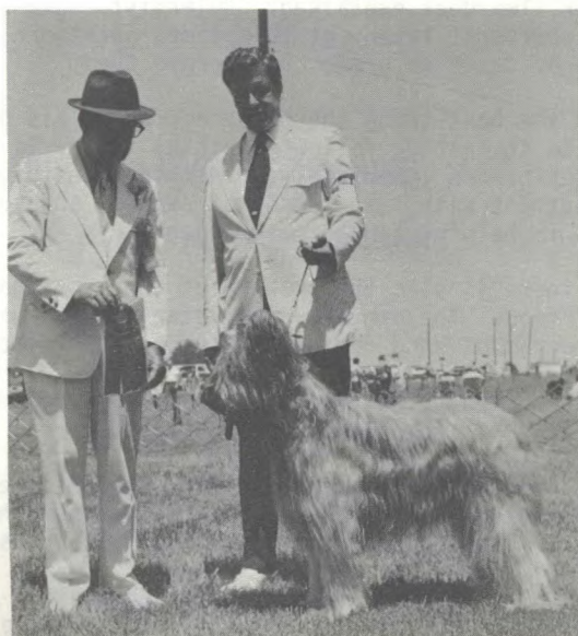
Ch. Pa'Chick's Tassie finished June 10, 1973