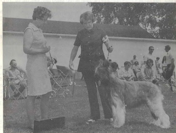
Ch. Pa'Chick's Unchained Melody finished July 8, 1973

AND CH. PA'CHICK'S REBECCA CHAMPIONS IN 29 DAYS AND 4 AM. & 1 CAN. FOR REBECCA