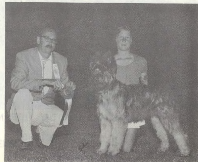
GROUP 1 AT PUPPY MATCH