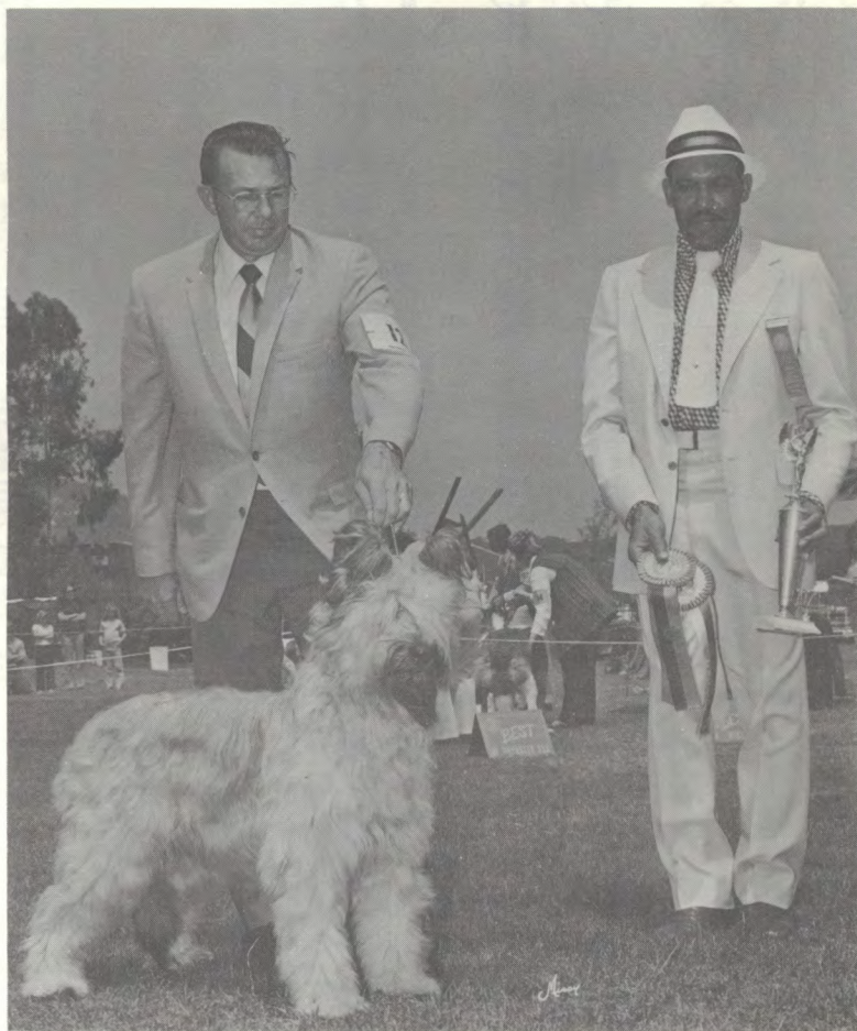
CHAMPION VAN'S MAGDALENE DU BEAUXJOLIS (bitch)