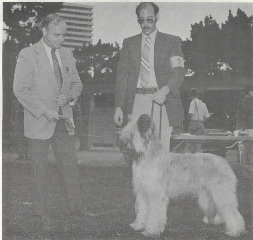
CHAMPION PA'CHICK'S UPSIE DAISY (bitch)