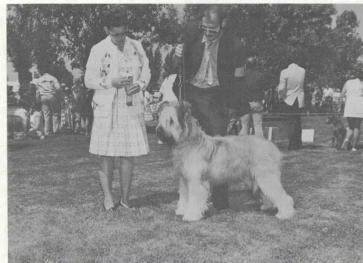
Ch. Pa'Chick's Upsie Daisy finished July 8, 1973